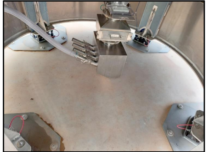
Fig. 2 - Pneumatic conveying discharge system