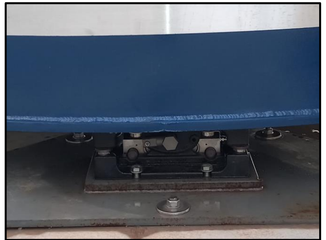
Fig. 4 – VC3500 installed with MasterMount®