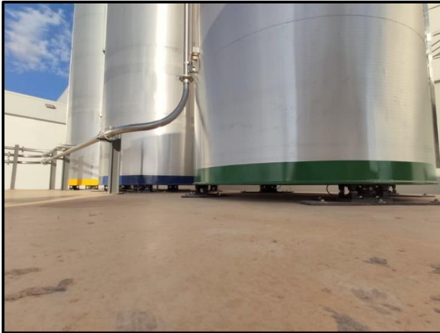
Fig. 1 - Skirted silos used for storing polymer granules

Client's Background: The client is a global leader in the design, development and manufacture of aerosol dispensing solutions that meet a wide range of market needs and different applications. These solutions utilise plastics and other polymers that are needed in the manufacturing process.